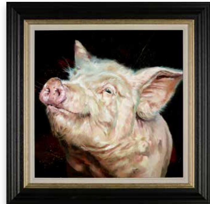
Happy Days Canvas on Board Edition of 95 Artwork Size: 20 x 20" £375

WITH AN UNERRING HAND AND EYE FOR THE DETAILS OF THE NATURAL WORLD, DEBBIE BOON RANGES ACROSS FOREST AND FIELD, WOODLAND AND FARMYARD IN HER OWN INIMITABLE STYLE. THIS MAJOR NEW COLLECTION OF HAND SIGNED EDITIONS CAPTURES MOMENTS OF STILLNESS OR MOTION, DRAMA OR HUMOUR WITH EXTREME ACCURACY AND A CHARMING LIGHTNESS OF TOUCH.