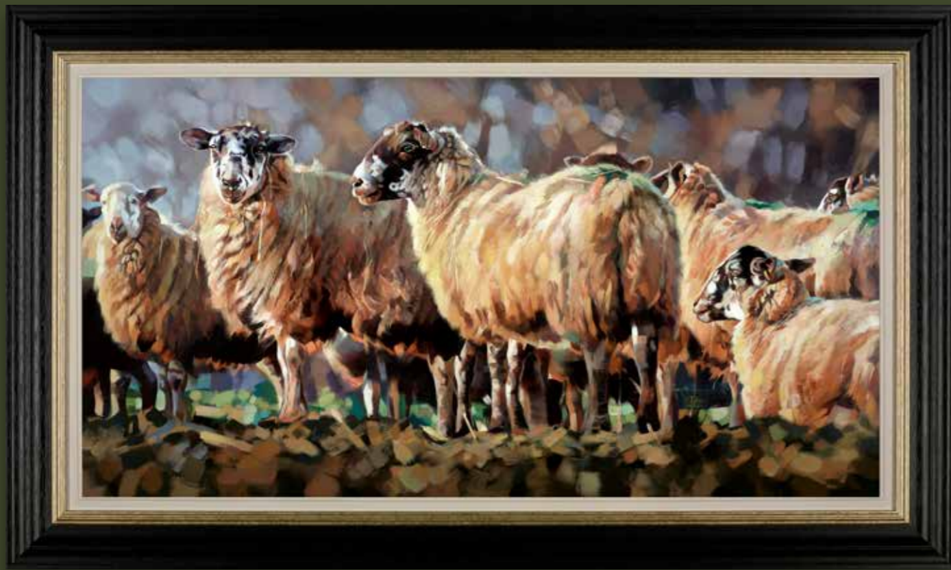
Evening Flock Canvas on Board Edition of 95 Artwork Size: 42 x 22" £650