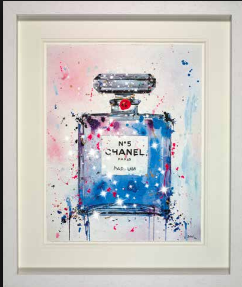
Heaven's Scent Paper Edition of 195 Artwork Size: 19 x 24" £650