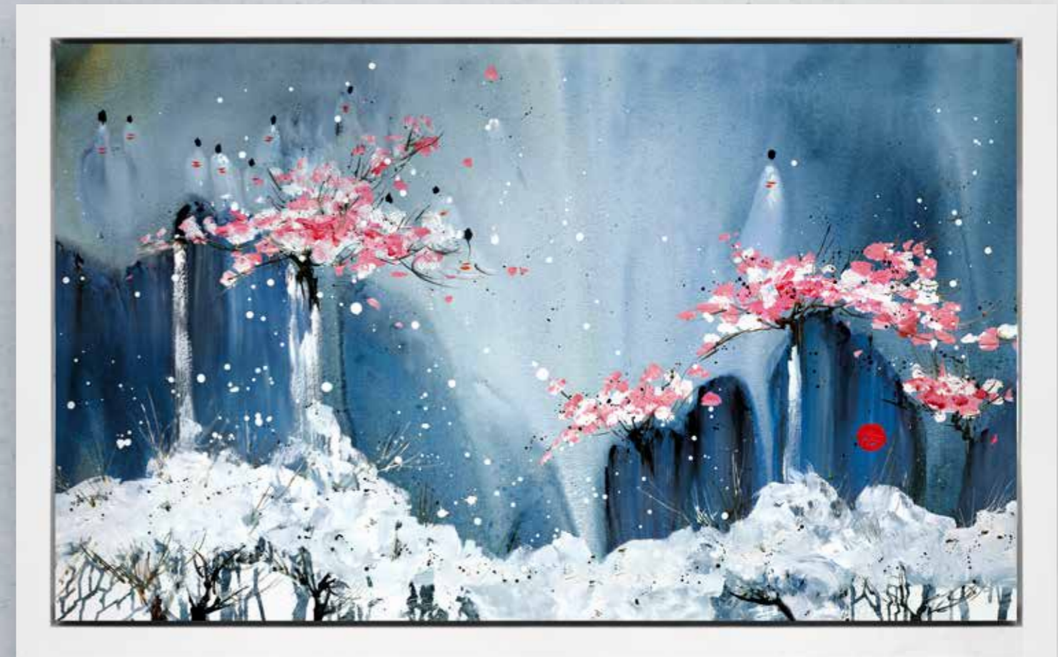
The Arrival Glazed Box Canvas Edition of 150 Artwork Size: 40 x 24" £1,095