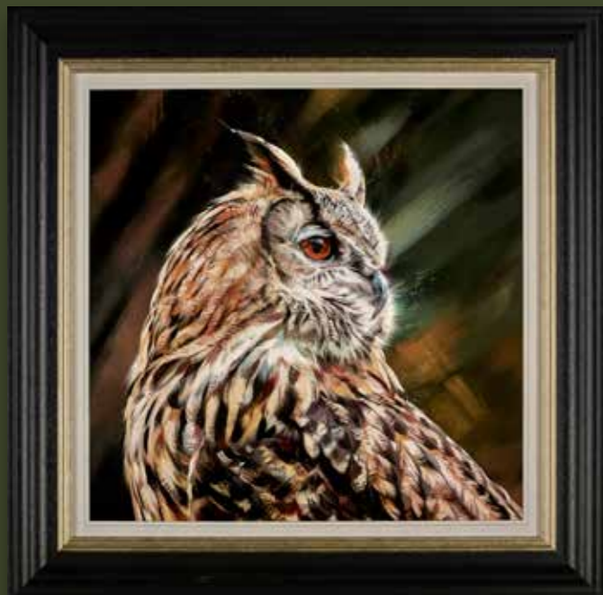
The Scholar Canvas on Board Edition of 95 Artwork Size: 20 x 20" £375