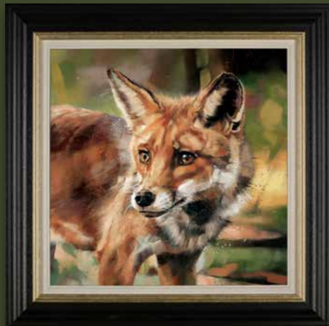
The Strategist Canvas on Board Edition of 95 Artwork Size: 20 x 20" £375