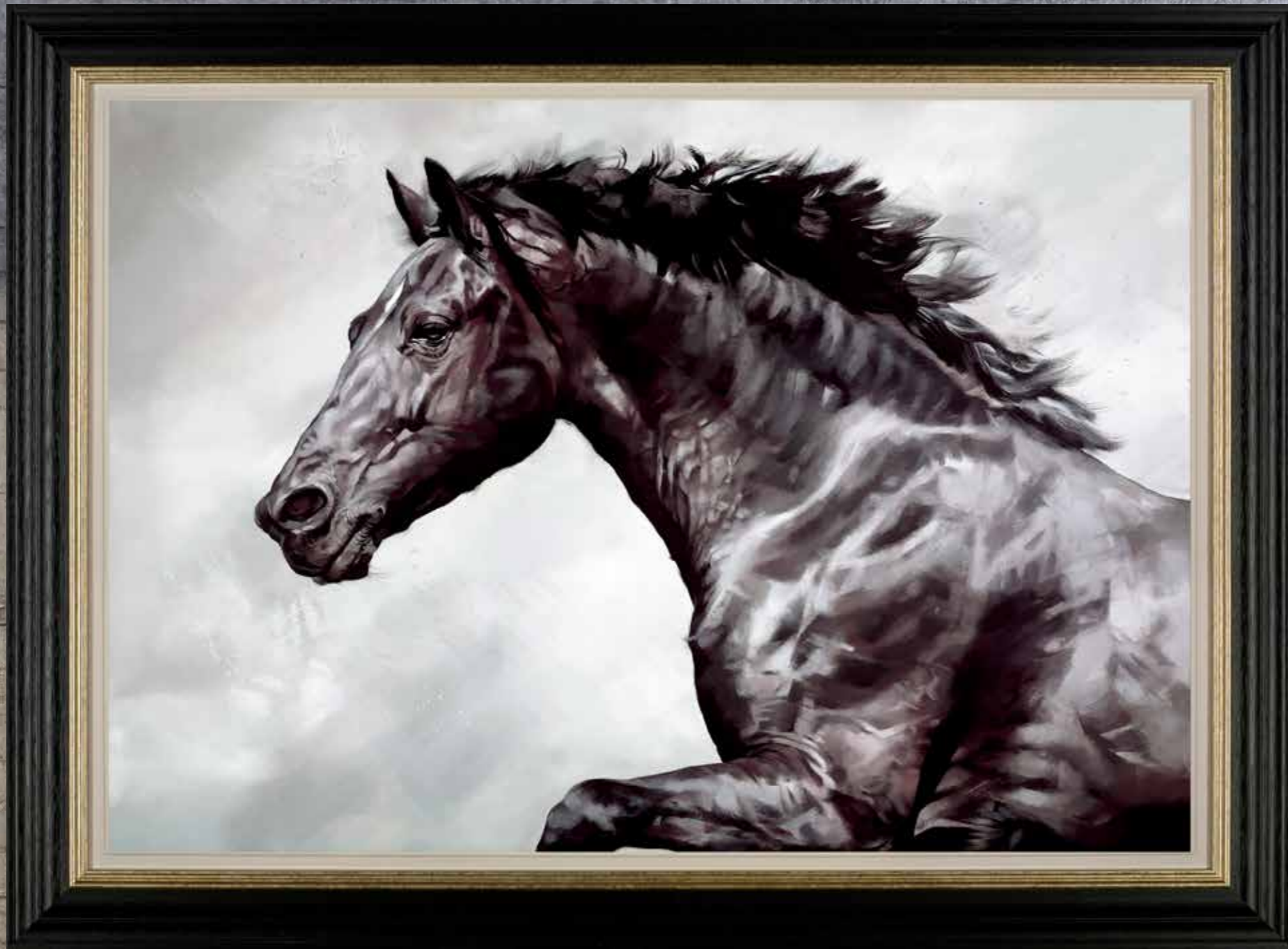
The Conqueror Canvas on Board Edition of 95 Artwork Size: 42 x 29" £695