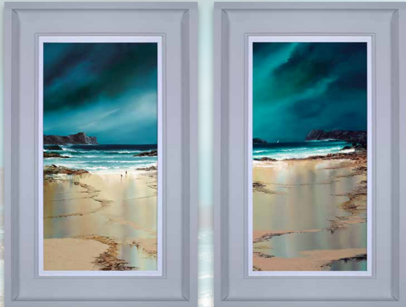
Peaceful Shoreline I CANVAS BOARD EDITION OF 195 ARTWORK SIZE: 11 x 22" £375

Whereas many artists hold to the traditional ideals of truth and beauty in art, to Philip the landscape of life and pursuit of perfection has an additional dynamic - drama. He brings movement onto his canvas, action into his brush-strokes and vibrancy into every corner of life. His landscapes are living things: a moment of almost Shakespearean action, combining elemental force with majestic grace.