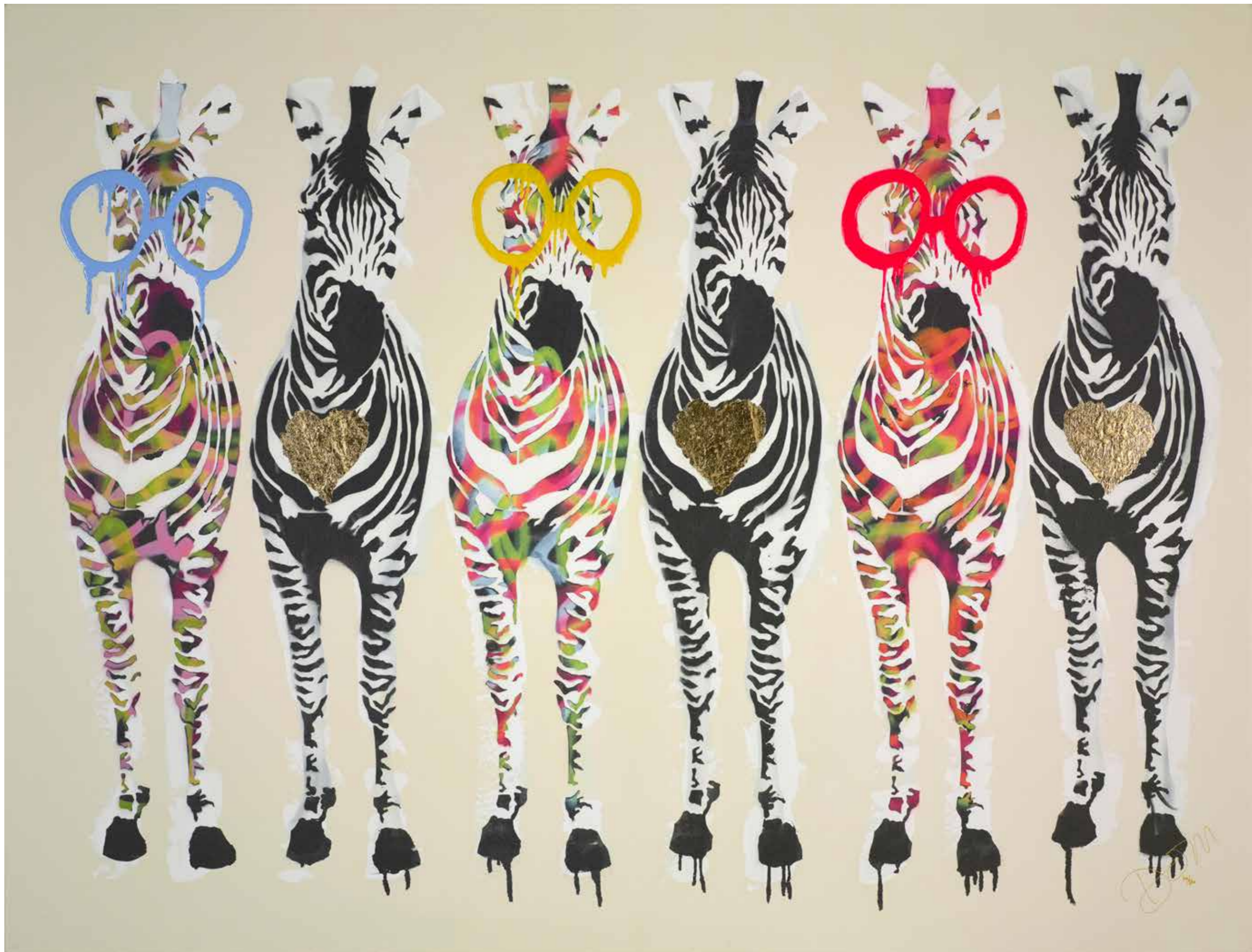
Stand out Stand Proud Box Canvas Edition of 250 Artwork Size: 42 x 32" £1,095