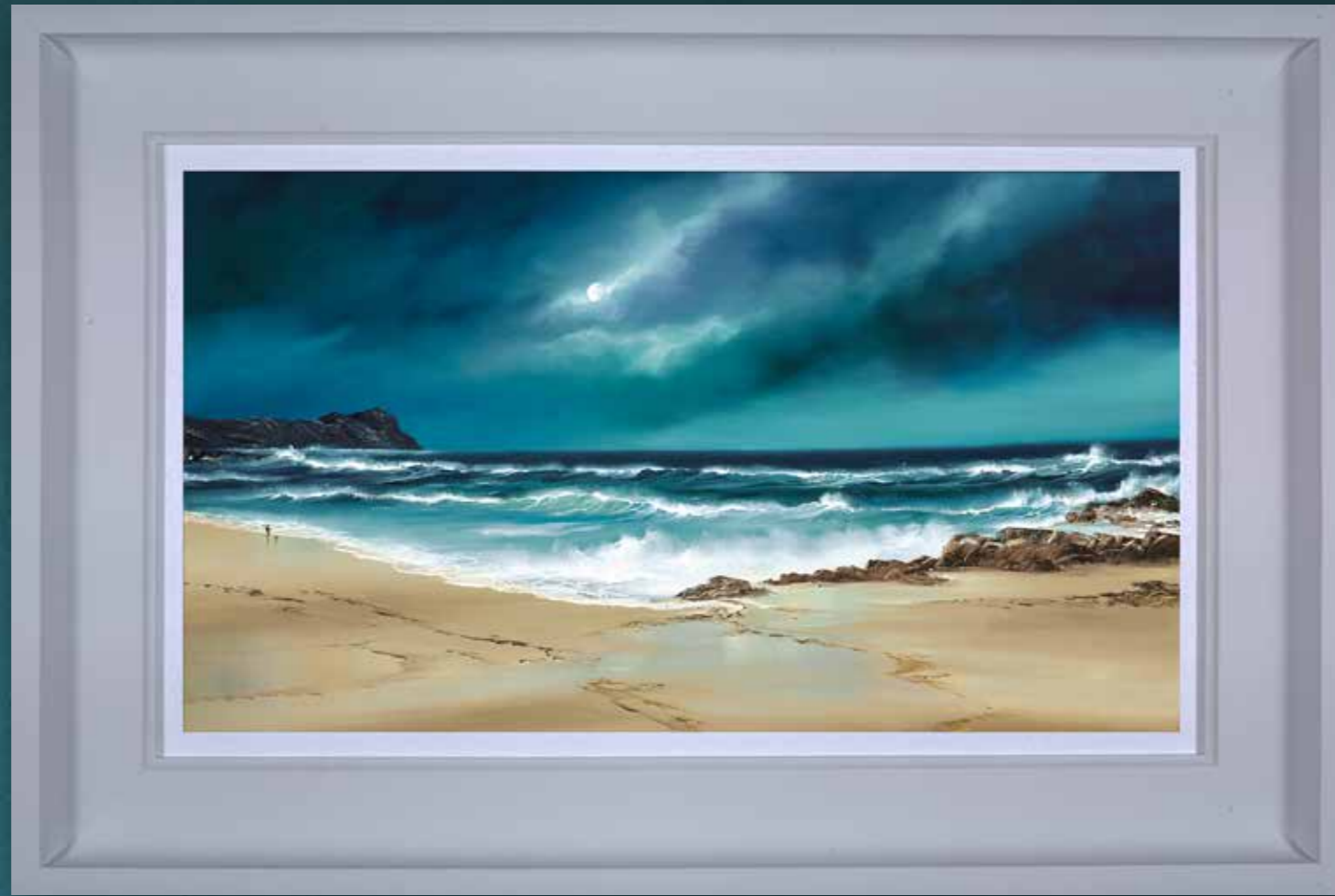
Moonlit Walk Canvas Board Edition of 195 Artwork Size: 32 x 18" £695