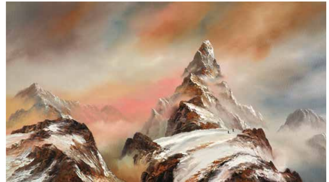
Scaling New Heights Canvas Board Edition of 195 Artwork Size: 32 x 18" £695

PHILIP'S BREATH-TAKING NEW COLLECTABLE EDITIONS EMBRACE THE SPIRIT OF ADVENTURE AS WE JOURNEY ALONG TRANQUIL SHORES TO AWE-INSPIRING MOUNTAIN PEAKS. DIVING DEEP OR SOARING HIGH, THESE NEW WORKS PERFECTLY ENCAPSULATE THE ESSENCE OF HIS 'EXTREME ART'.