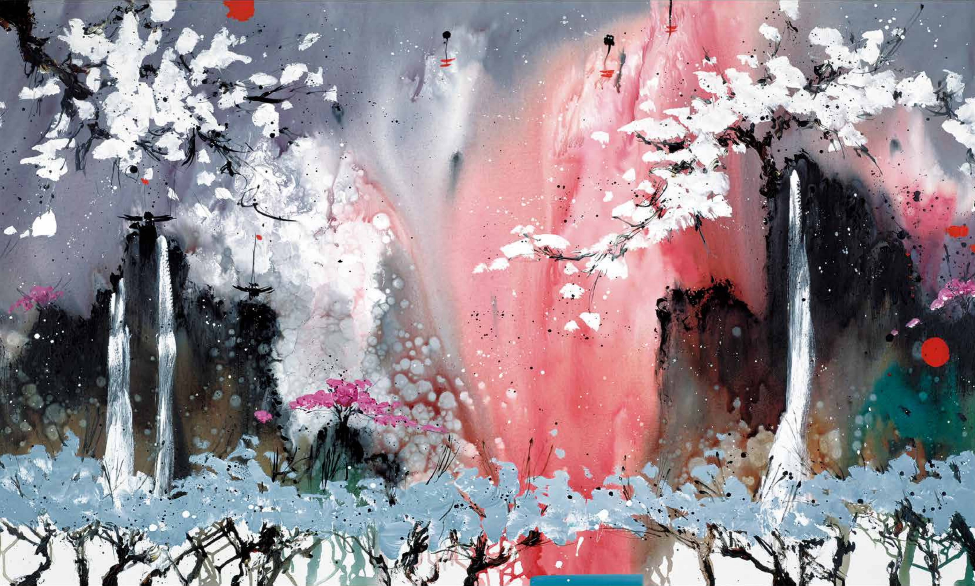
When we Dream Glazed Box Canvas Edition of 150 Artwork Size: 40 x 24" £1,095