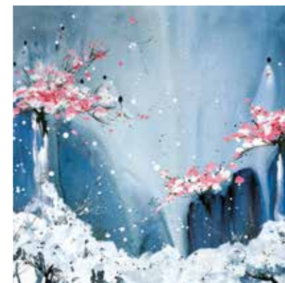
DANIELLE O'CONNOR AKIYAMA