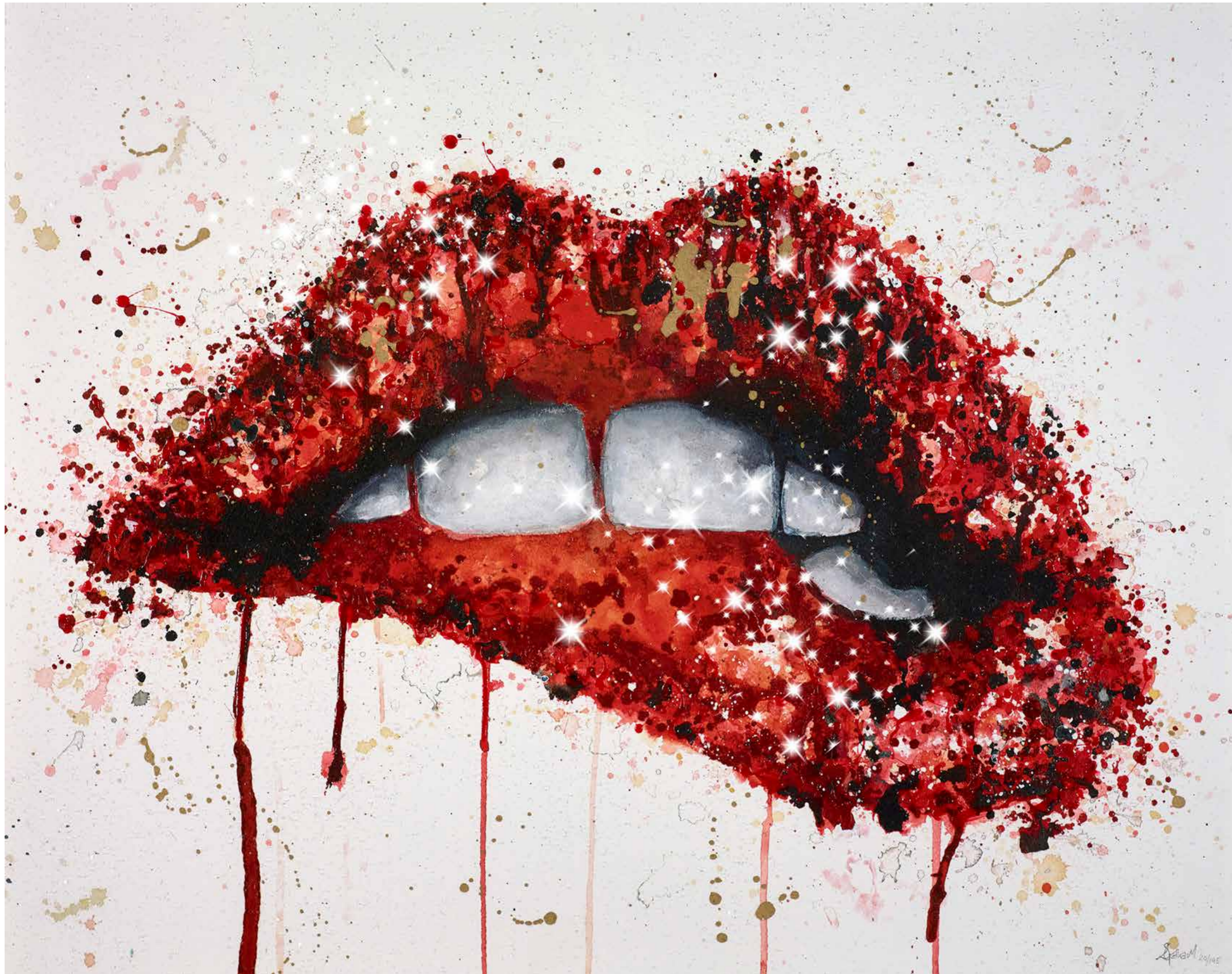
Read My Lips Paper Edition of 195 Artwork Size: 24 x 19" £650