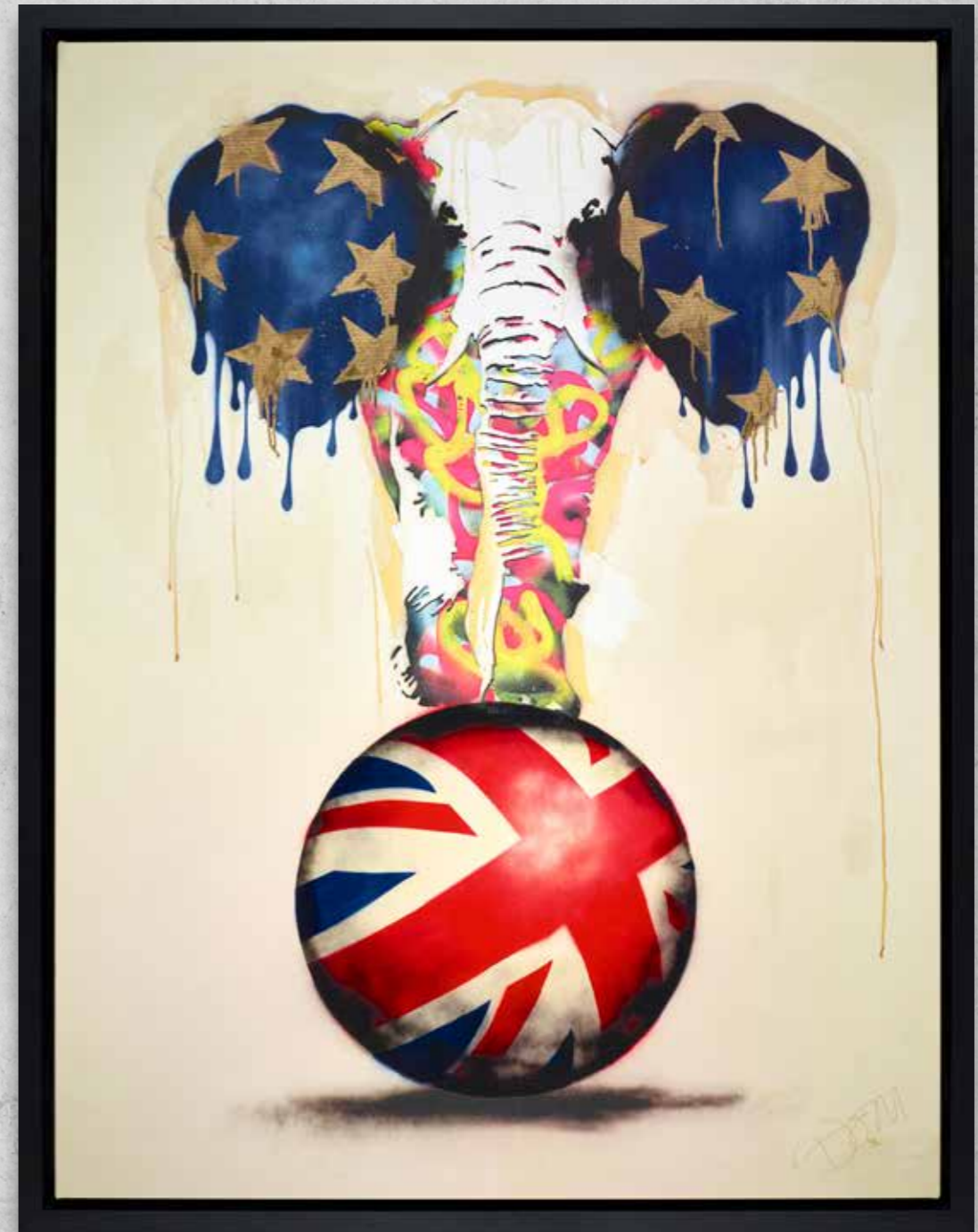
On the March Box Canvas Edition of 250 Artwork Size: 32 x 42" £1,095

Collected by a who's who of A-list celebrities (Brad Pitt, Liam Gallagher and George Clooney among them), commissioned by the biggest brands and celebrated by the media, Pattinson has become a major presence on the international stage and is now one of the world's most successful studio-based street artists.