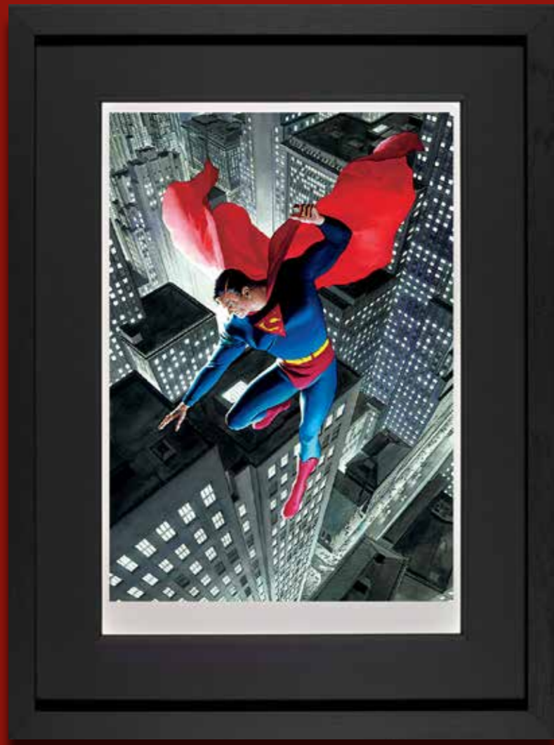
SUPERMAN 20TH CENTURY Paper Edition, Size: 15 x 26", Edition Size: 195 £595

Ross depicts the Man of Steel hovering high above his beloved Metropolis scanning the city for any who are in distress. With the blink of an eye Superman, the world's greatest super hero, speeds to the rescue of all in need.